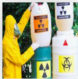
Scheduled Waste Management