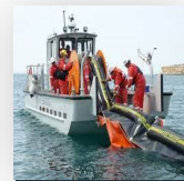
Oil Spill Remediation & Emergency Services

NRS has been engaging in business that involving scheduled waste for almost 16 years. Our services of tank cleaning, desludging and spill services is proven with convincing track record. We also achieve zero non compliance report from Department of Environment (DOE) throughout our operation.